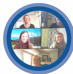
Vision Council 272 hours