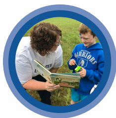
Board of Directors 302 hours