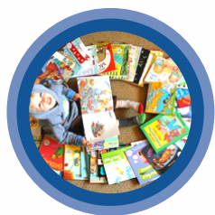
Imagination Library 40 hours

*Llama Llama Read O' Rama and Chili Cook Off: Canceled due to COVID-19