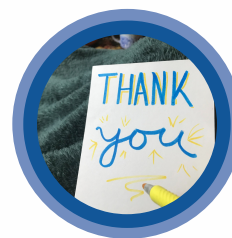
Thank You Notes 65 hours