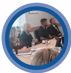
Campaign Coordinators 150 hours