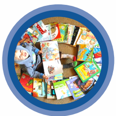
Imagination Library 40 hours

*Llama Llama Read O' Rama and Chili Cook Off: Canceled due to COVID-19