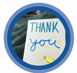
Thank You Notes 65 hours