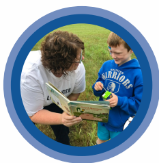
Board of Directors 302 hours