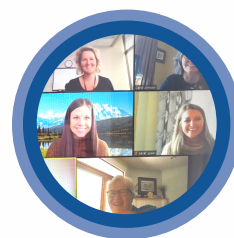
Vision Council 272 hours